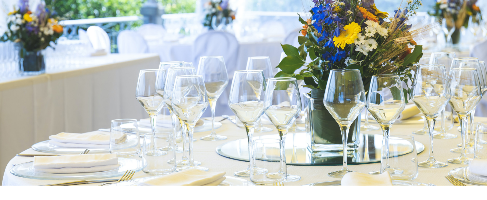
The Parklake is centrally located in Shepparton's prime location, with stunning views overlooking Lake Victoria and surrounding parklands.

With superior customer service, a delicious range of menus and luxury discounted accommodation for your guests, you can be confident that every last detail will be taken care of.